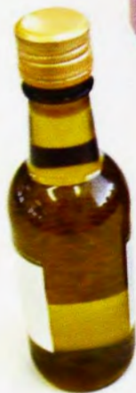
Single serve wine bottle