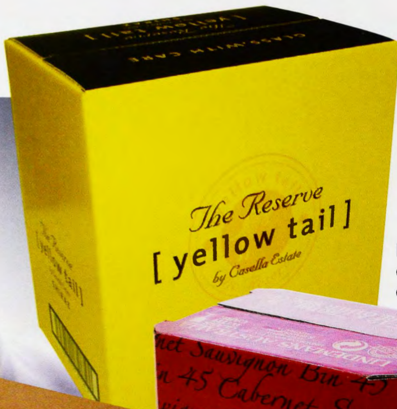
Pre-printed corrugated cartons