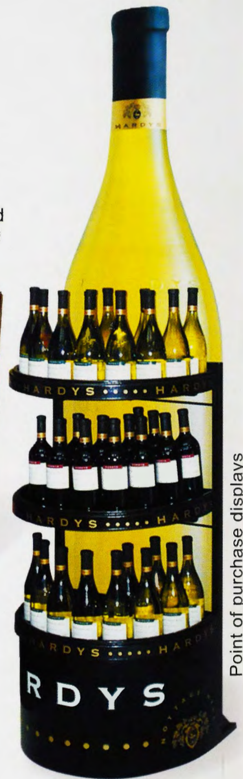
Point of purchase displays