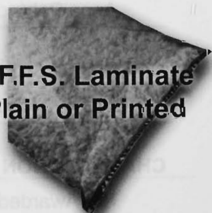
V.F.F.S. Laminate Plain or Printed

CRYOVAC AUSTRALIA PTY LTD 1126 SYDNEY ROAD, FAWKNER 3060 Phone 03 9359 2244 FAX 03 9358 2329 www.sealedair.com.au © Registered Trademark of Sealed Air Corp. SAC 2079 ABN 63 004 207 532