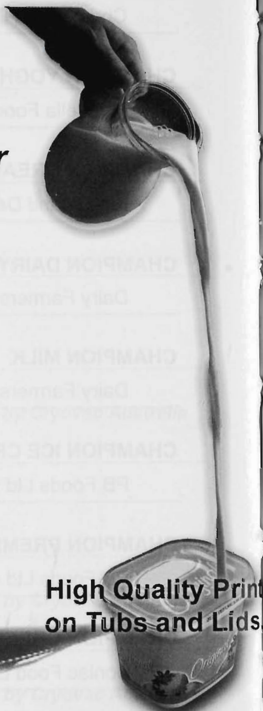
High Quality Print on Tubs and Lids