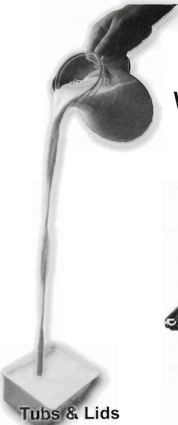
Tubs & Lids For Spreads