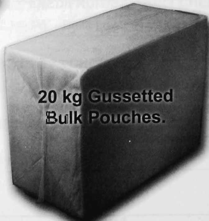
20 kg Gussetted Bulk Pouches.