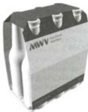
CLUSTER PAK® OVER THE CROWN