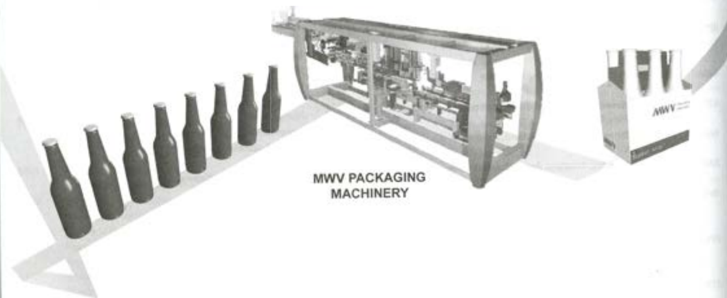
MWV PACKAGING MACHINERY

MWV can provide low cost entry level packaging machinery ideal for test marketing purposes or high speed, high flexibility machinery enabling Brand Owners to segment the market with different packaging. When this machinery is then combined with MWV case packers, a total packaging solution is created that offers improved line efficiencies, reduced labour cost and a smaller footprint than traditional secondary and tertiary packaging equipment.