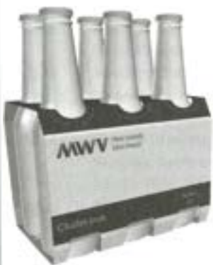
CLUSTER-PAK® NECK THROUGH