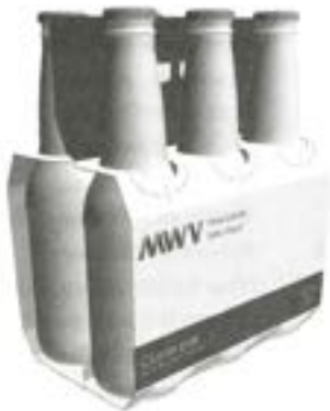
CLUSTER-PAK® NECK THROUGH HANDLE