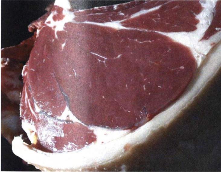
Exhibit 194, Mawarra B Herefords: (HH), Bred By: Turner Partnership, 90.34