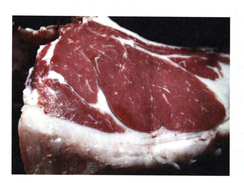
Exhibit 179, Longerenong College: (LL/AAXRA), Bred By: Longerenong College, 91.61