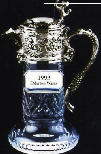
1993 Elderton Wines