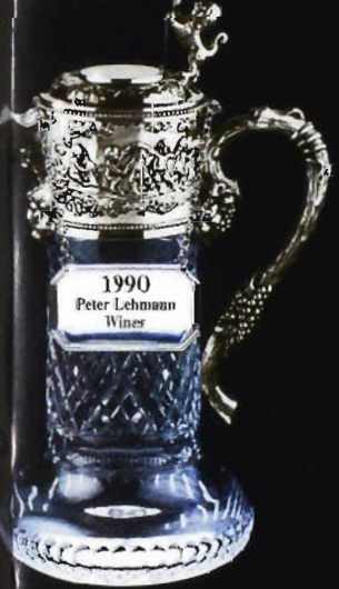
1990 Peter Lehmann Wines