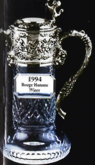
1994 Rouge Homme Wines