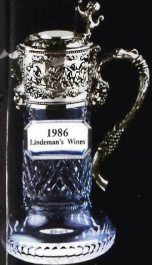
1986 Lindeman's Wines