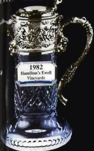
1982 Hamilton's Fwell Vineyards