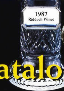
1987 Riddoch Wines