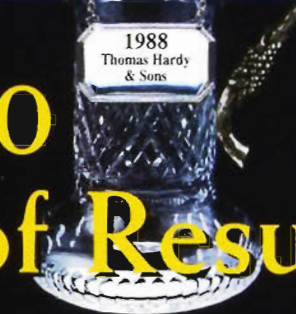
1988 Thomas Hardy & Sons