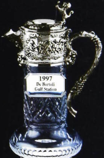
1997 De Bortoli Gull Station