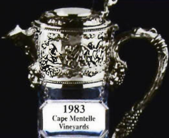
1983 Cape Mentelle Vineyards