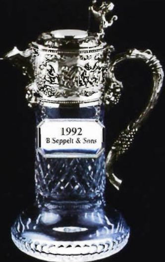
1992 B Seppelt & Sons