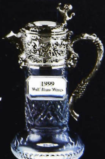
1999 Wolf Blass Wines