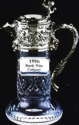
1996 Hardy Wine Company