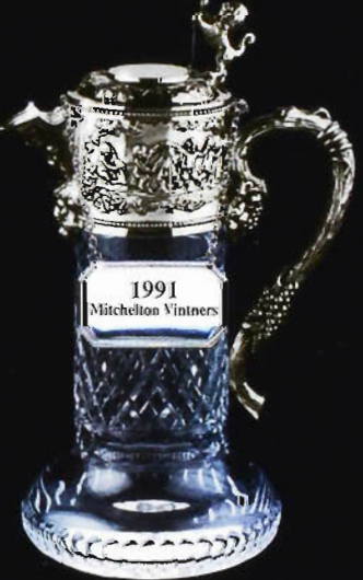
1991 Mitchelton Wintners