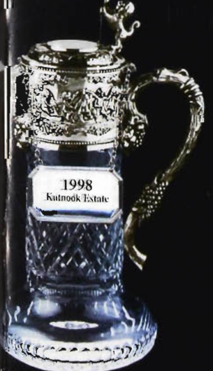
1998 Kutnook Estate