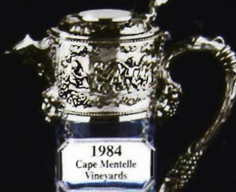
1984 Cape Mentelle Vineyards