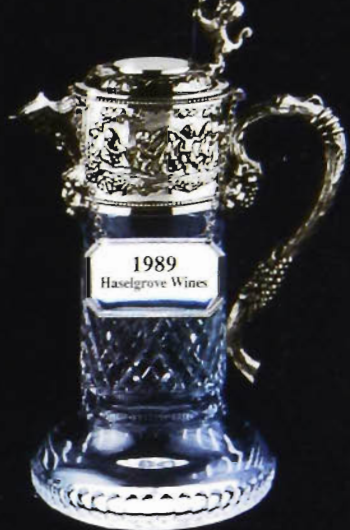
1989 Hasegrove Wines