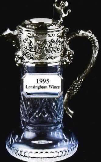
1995 Leasingham Wines