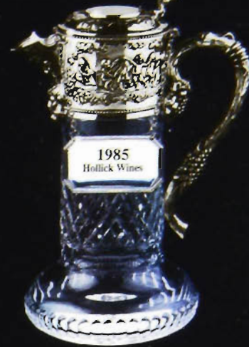
1985 Hollick Wines