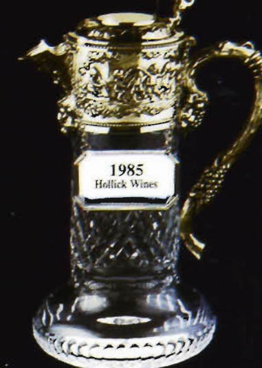
1985 Hollick Wines