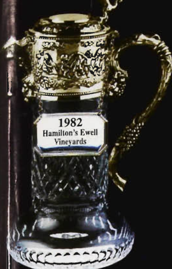
1982 Hamilton's Ewell Vineyards