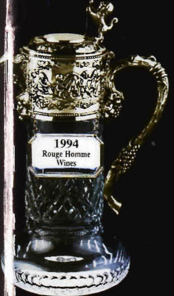
1994 Rouge Homme Wines