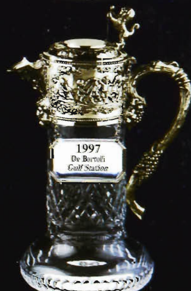
1997 De Bortoli Golf Station