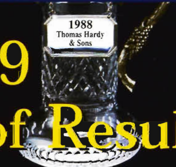
1988 Thomas Hardy & Sons