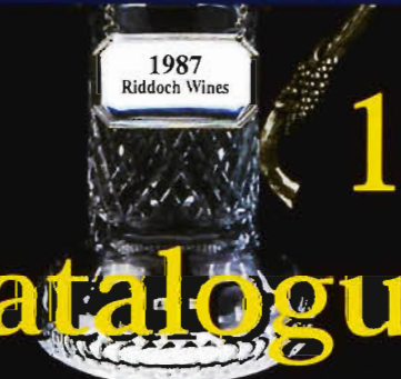
1987 Riddoch Wines