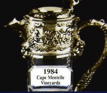
1984 Cape Mentelle Vineyards