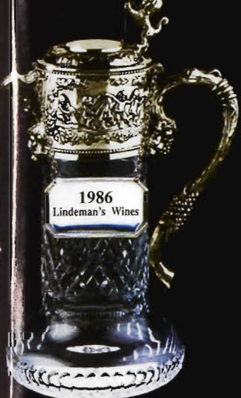
1986 Lindeman's Wines