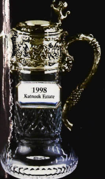
1998 Katnook Estate