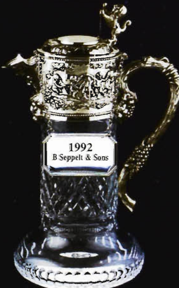
1992 B Seppelt & Sons