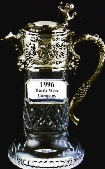
1996 Hardy Wine Company