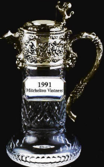
1991 Mitchelton Vintners