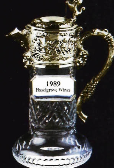
1989 Haselgrove Wines