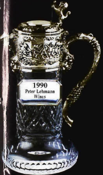
1990 Peter Lehmann Wines