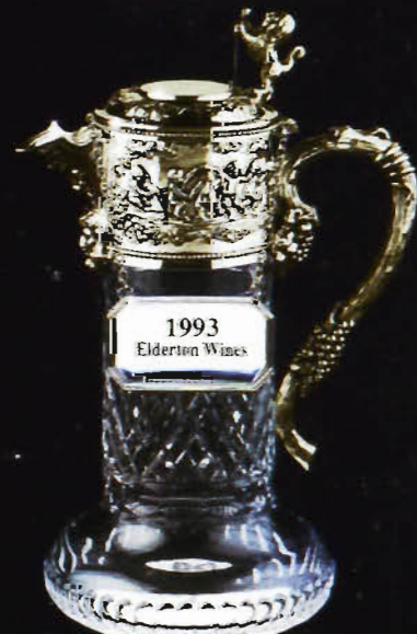
1993 Elderton Wines