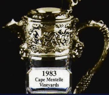
1983 Cape Mentelle Vineyards