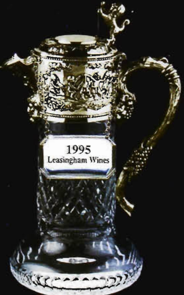
1995 Leasingham Wines