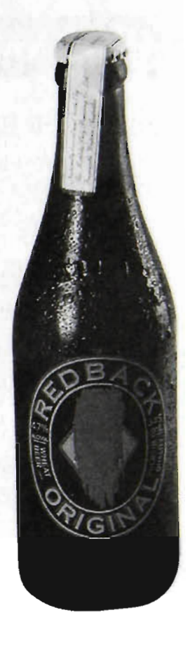
1993 Redback Original Wheat Beer