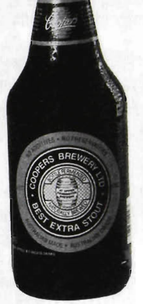
1994 Coopers Best Extra Stout