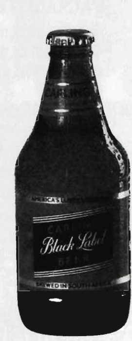
1996 South African Breweries: Carling Black Label