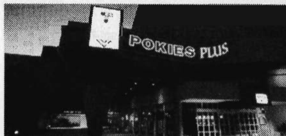
ONE ENTIRE LEVEL DEVOTED TO FUN - INCLUDING POKIES PLUS.