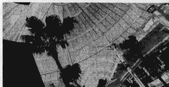
OVER 300 FABULOUS SHOPS, BOUTIQUES & DEPARTMENT STORES.

Victoria's largest shopping and entertainment centre.